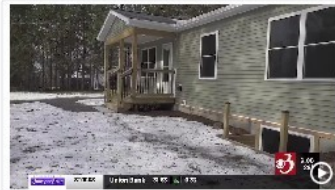
Family to turn key of first Habitat for Humanity home in C...